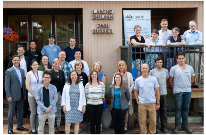
Representatives from the various businesses that assisted in the upgrade project gathered at L'Arche to celebrate its completion, giving people at L'Arche an opportunity to express our gratitude.