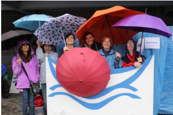
Singing in the rain at the Canada Life Softball Tournament

We were honoured to be chosen as one of the two charities benefitting from Canada Life's Charity Softball Tournament on July 24 at Softball City in Surrey. Even though it was the rainiest day of the summer, we had a lot of fun with the activities we hosted for players and their families. Money raised at this event will go towards a new community vehicle that will be shared by the houses.