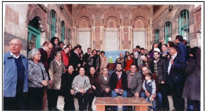
Thank you ... Merci... ... شكراً