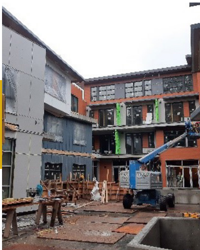
The Courtyard looking East