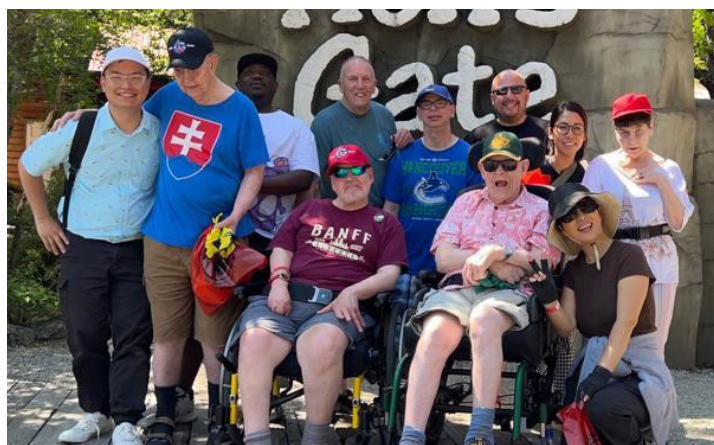
Creation House on a road trip