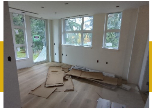
Looking toward the park from one of the L'Arche homes